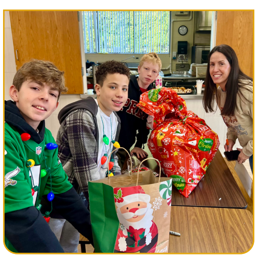
Operation Santa Claus: Our Giving Tree team thanks you for your generous hearts.