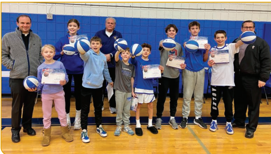
Last Saturday, after the CYO Mass, our Knights Council hosted its annual Free Throw Contest. Here are some of this year's winners. See page 5 for more details.

Congratulations to our newly baptized! For baptismal information, visit our website for an intake form, call or email baptisms@stmarymagdalen.net