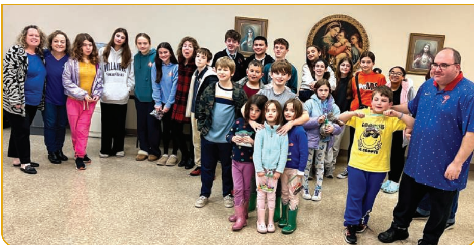
Last week, our 7th graders hosted an Ecumenical Gathering with our friends from the Congregation Beth El-Ner Tamid in Broomall.