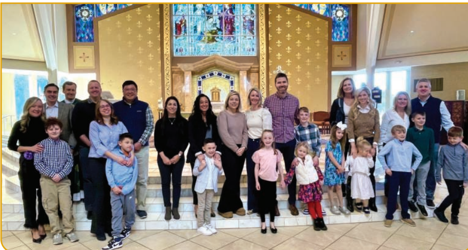
Please pray for all those preparing to enter the Church through the Rite of Christian Initiation: catechumens, candidates, their families and sponsors.