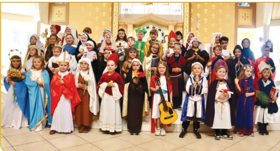
Our first graders embodied the Saints on October 31.