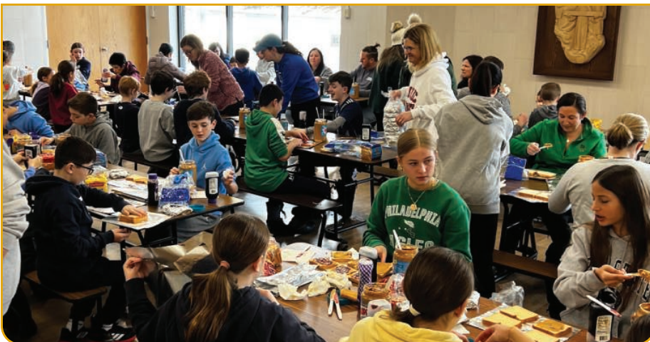
Students, parents, faculty, and staff gathered on Monday for a day of service in honor of Martin Luther King, Jr. They collected diapers and made sandwiches for CSS.