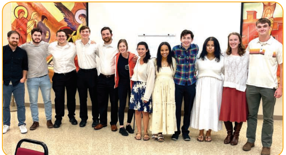
Young Adults gather after our 7 PM Mass on Sundays for fun, food, and fellowship. See page 6 for more young adult events.