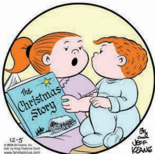
12-5 "Putting Baby Jesus in swaddling clothes was the first Christmas present wrapping."