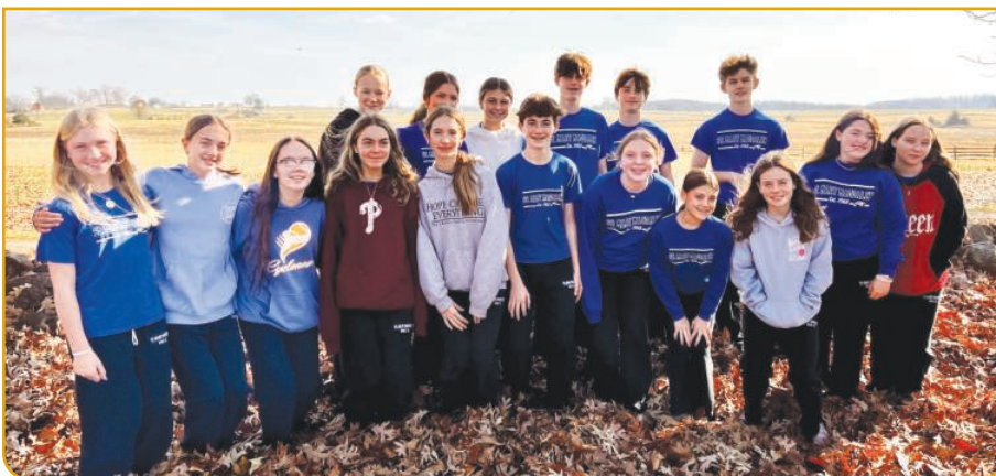
On November 18, the 8th graders in the school got to experience history at Gettysburg.